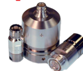
RAPIT FIT™ Connectors